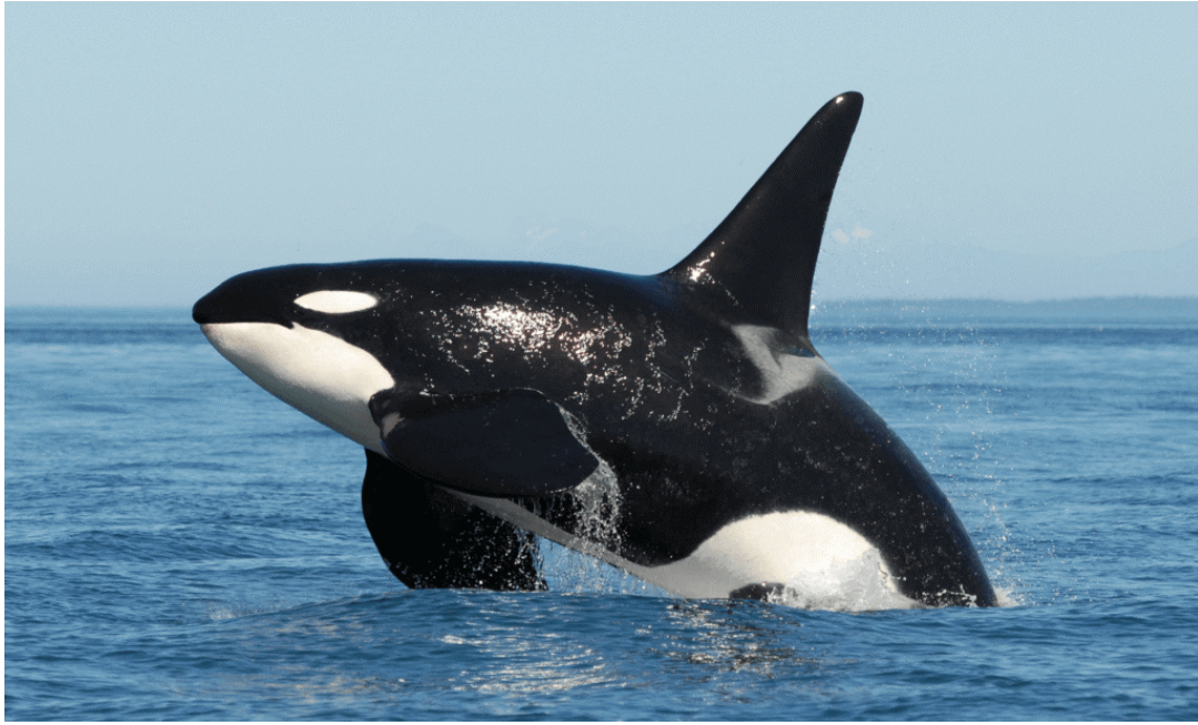
Salish Sea L-pod orca.