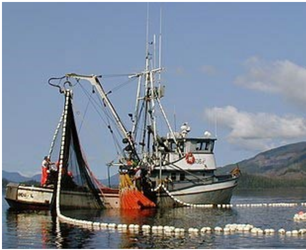
Purse seining salmon in Alaska

3.2.2: Biomass Risk. Available data allows managers to reliably monitor escapement of target and non-target salmon, so that harvest rates can be reduced when necessary to protect spawning biomass, and fishing can be halted or modified if necessary when biomass falls below any minimum stock size thresholds.