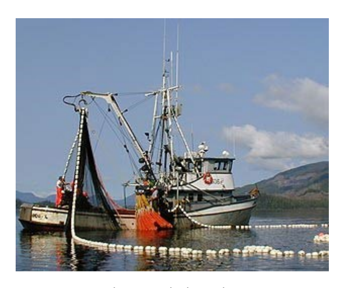
Purse seining salmon in Alaska

C: Available data fail to satisfy three or more requirements in indicators 3.2.1.1 through 3.2.1.6.