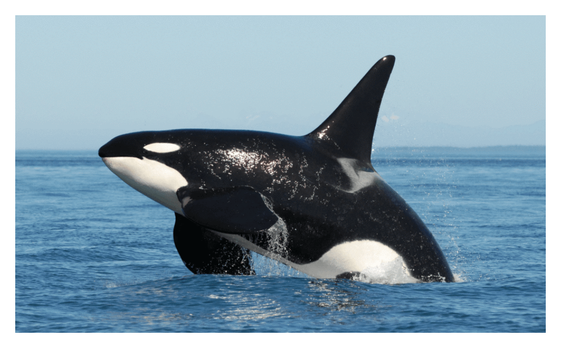
Salish Sea L-pod orca.