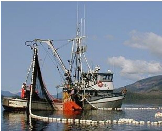
Purse seining salmon in Alaska

C: Available data fail to satisfy three or more requirements in indicators 3.2.1.1 through 3.2.1.6.