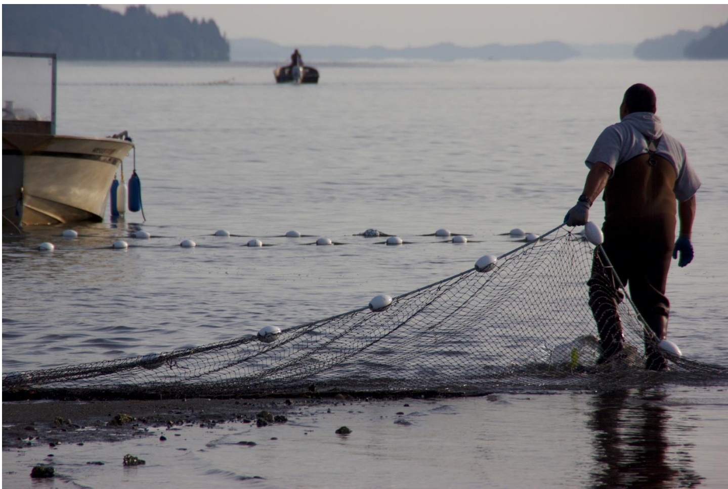
Tribal salmon fishing