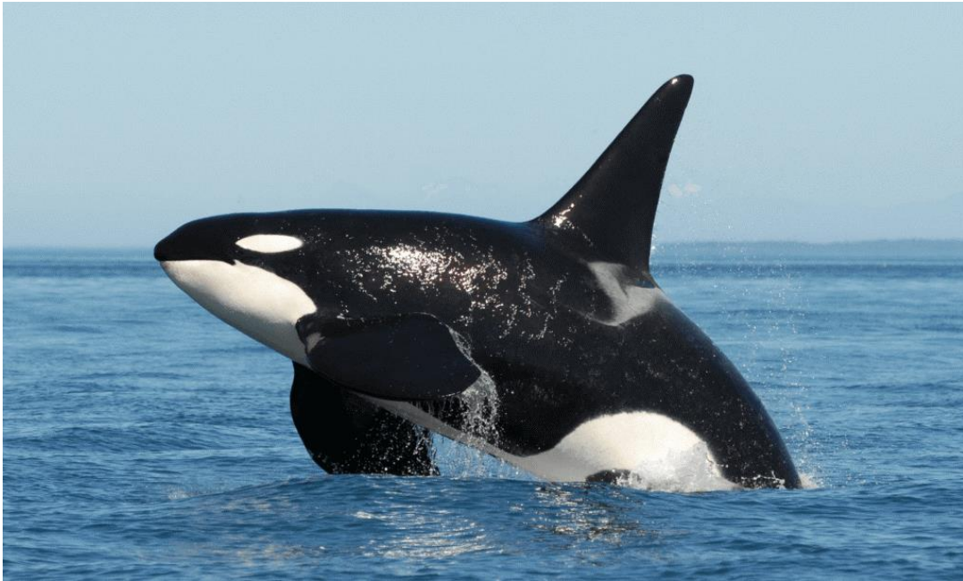
Salish Sea L-pod orca.